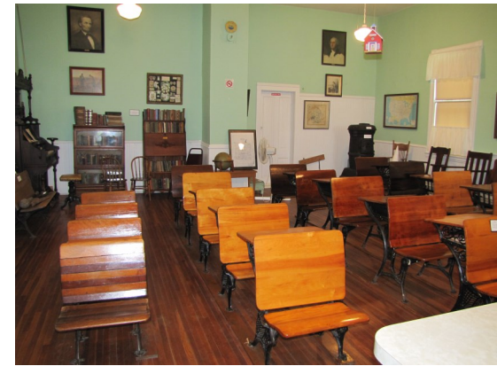
How the room looks today

Donations or loan of items (for display purposes) of any memorabilia from the Burschville/Corcoran area and District #107 would be welcomed!