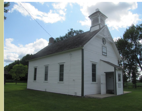
Burschville School—District #107

TRAVEL BACK IN TIME TO THOSE LONG AGO DAYS OF THE ONE ROOM SCHOOL.