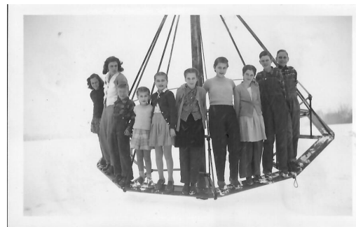
Kids at play abt 1946

THAT'S WHERE THE MEMORIES AND STORIES COME BACK TO MANY WHO RETURN FOR